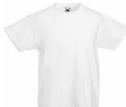
Plain white t-shirt