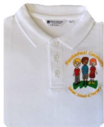
White polo shirt – with or without logo

School uniform promotes equality and gives children an added sense of belonging. All children coming to school prepared for the day and taking a pride in how smart they are.