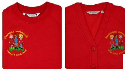
Red sweatshirt or cardigan – with or without logo