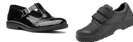
Sensible black footwear