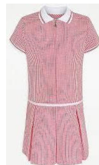
Red gingham dress for Summer term