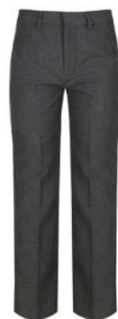
Grey trousers or shorts