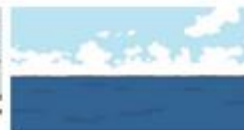
sea or ocean